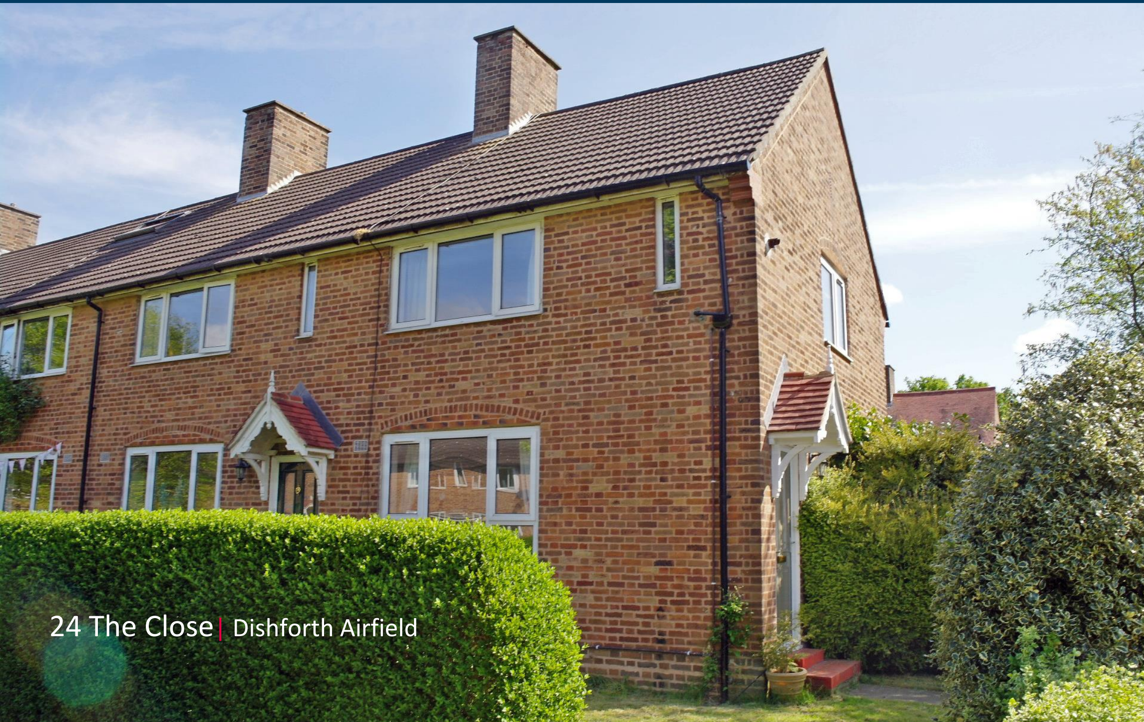
24 The Close | Dishforth Airfield